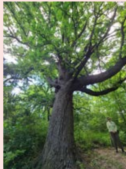
Historic Bur Oak