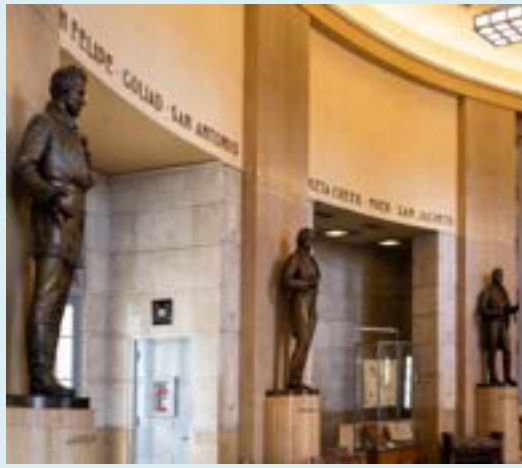
Coppini statues in the Hall of Heros