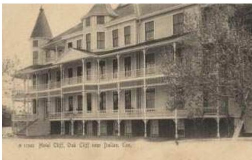
Hotel Cliff, Oak Cliff ca 1905 Image from postcard

http://digitalcollections.smu.edu/all/cul/gcd/